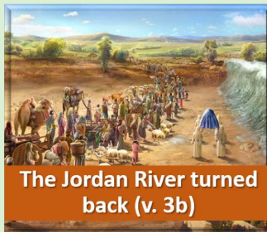
The Jordan River turned back (v. 3b)