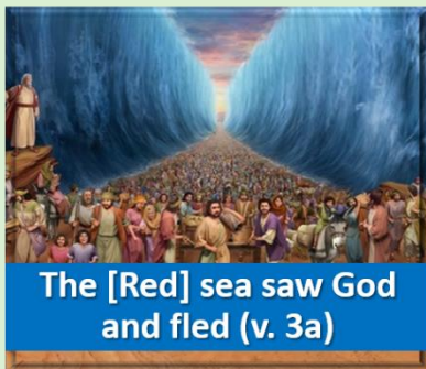
The [Red] sea saw God and fled (v. 3a)