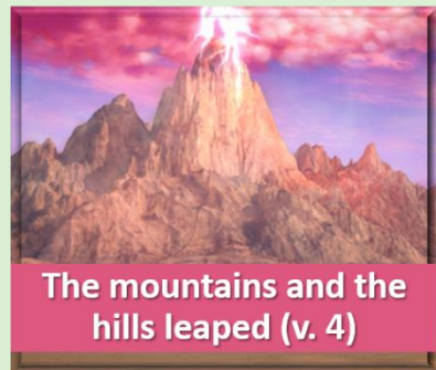
The mountains and the hills leaped (v. 4)